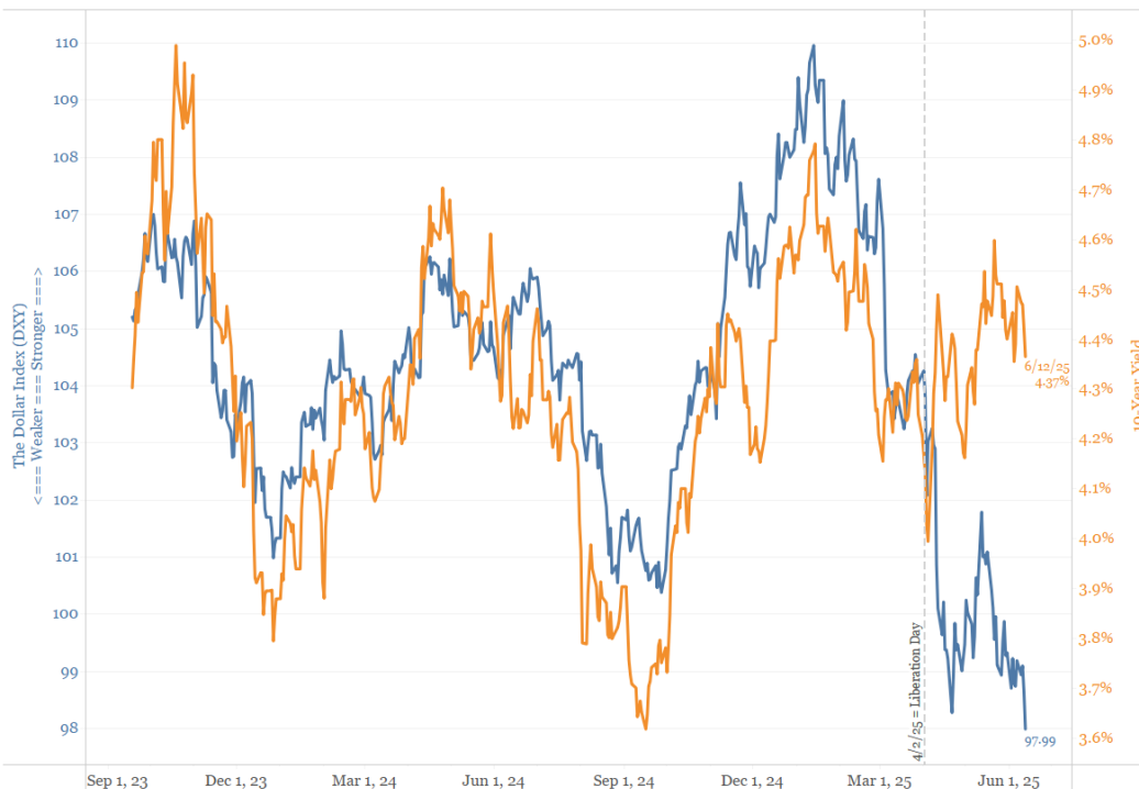
The Dollar Index (DXY) and U.S. 10-Year Yields

All the talk/worry about the ability to sell Treasuries was totally misplaced. This was never the case.