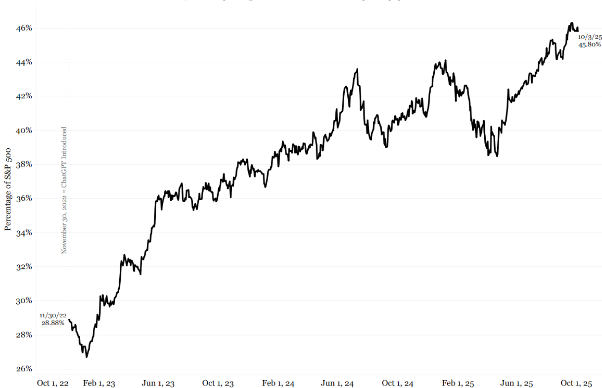
How Much of the S&P 500 Is AI Related Stocks? 41 Stocks Spanning Direct AI, AI Utilities & AI Capital Equipment