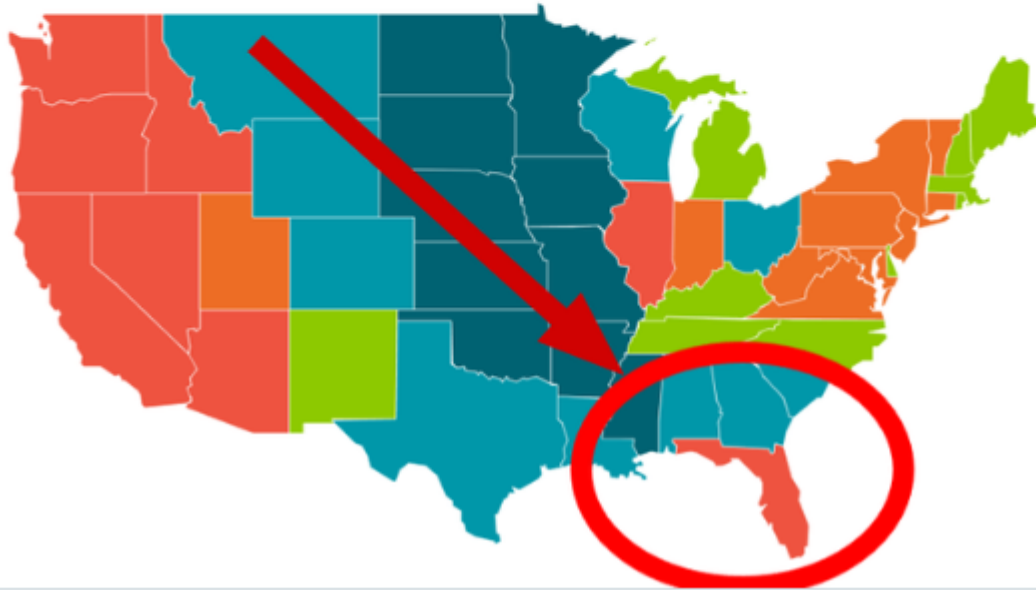
United States - Average for Regular

why is FL suddenly one of the most expensive states for gasoline? it's one of the largest gasoline consumers in the country, and has ZERO refining capacity. every gallon has to be shipped in- and right now, Florida is having to outbid other markets to get it. could get worse.